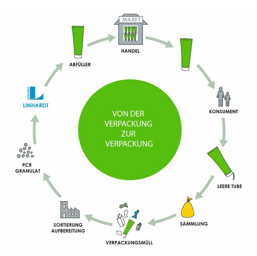
Figure 1: PCR circuit

During production of the PCR material, the crushed milk bottles are cleaned in a complex process and filtered by means of camera systems and centrifuges. The flakes extruded into new are then aranulate in regranulation а process. However, the granulate is given certain properties, which we would like to explain in more detail below: