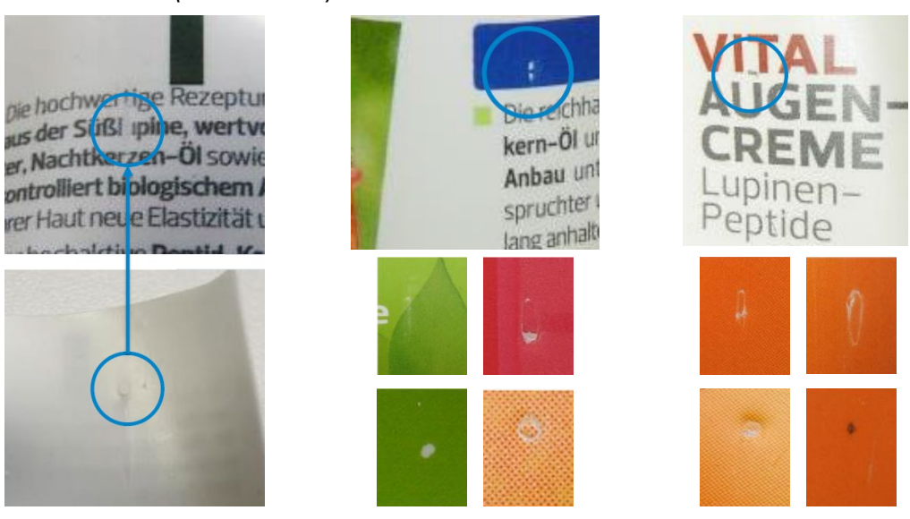
Figure 4: Particle and material inclusions as interfering factors for the decoration on the outside of the tube

The particles pressed through on the inside can lead to partial artefact formation on the outside printing. In the area of existing particles, the tube no longer lies flat on the underlying stainless steel mandrel, so that the plate pressure is partially increased and more ink is applied in this area, which can manifest itself as a dark spot. We would like to point out that the wall thickness can have a significant influence here. With a thinner wall thickness < 350 \mu m, this effect will be stronger compared to the conventional 500 \mu m. The material mix also has an influence. The harder the mixture, the better this effect can be compensated for.